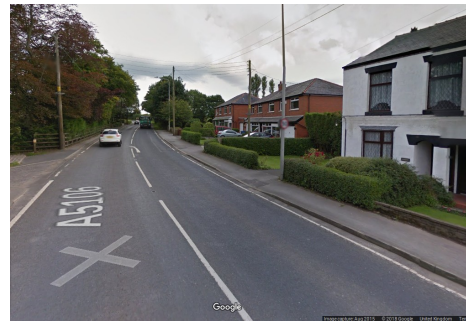
Approach from Standish

Directions from the North: Leave the M61 at Junction 8 and follow the signs to Chorley on the A6. Pass B&Q, McDonald's, Chorley Train Station and Morrison's and follow the A6 towards Bolton. Pass the Yarrow Bridge Hotel on the left and at the second set of traffic lights take the right turn on to the A5106 Wigan Lane to Wigan. Wigan Lane Playing Fields are approximately 1 mile away on the right.