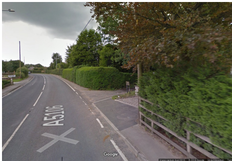
Approach From Chorley

Click here for Google Maps Shade Ln, Chorley PR7 4BY