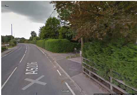
Approach From Chorley

Click here for Google Maps Shade Ln, Chorley PR7 4BY