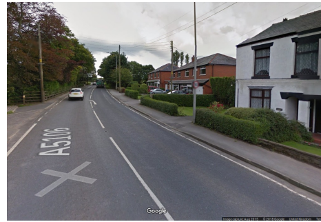
Approach from Standish

Directions from the North: Leave the M61 at Junction 8 and follow the signs to Chorley on the A6. Pass B&Q, McDonald's, Chorley Train Station and Morrison's and follow the A6 towards Bolton. Pass the Yarrow Bridge Hotel on the left and at the second set of traffic lights take the right turn on to the A5106 Wigan Lane to Wigan. Wigan Lane Playing Fields are approximately 1 mile away on the right.